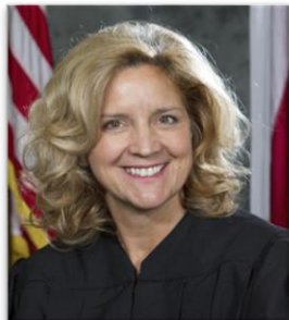
Founding Judge Renee Yanta

PEARLS Court was started by Judge Renee Yanta in 2015. It relied solely on volunteers. In January of 2019, Judge Rosie Alvarado and Judge Angelica Jimenez became the judicial leaders of Pearls Court. In 2020, Judge Canales expanded to meet the needs of male youth through the EAGLES Court. These courts now make up the Restorative Foster Care Courts of Bexar County and have a Court Manager, two Court Monitors, two dedicated licensed therapists and a volunteer base of 50+ dedicated individuals. PEARLS Foundation was created to support these efforts and is led by Judge Yanta.